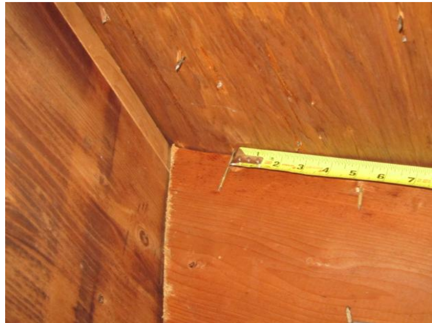
8d Nails Spaced 6" x 6"