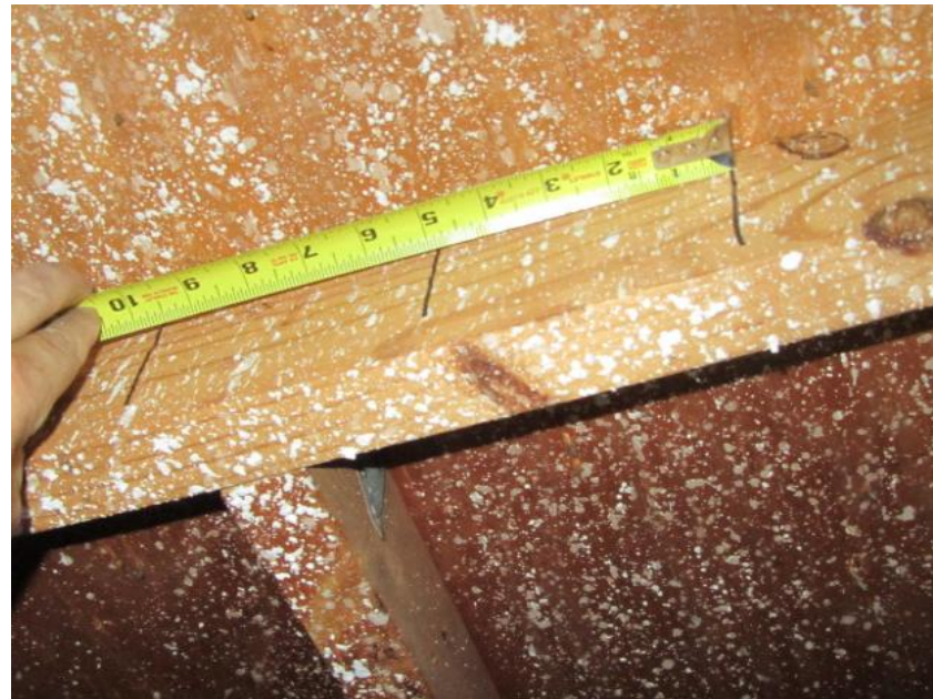
8d Nails Spaced 6" x 6"