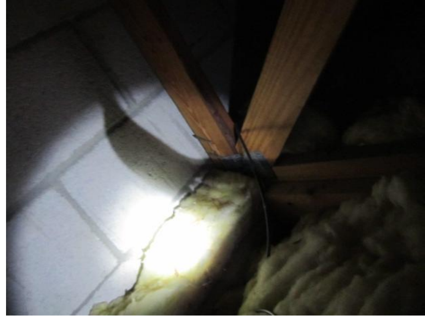
Opposing Side of Clips