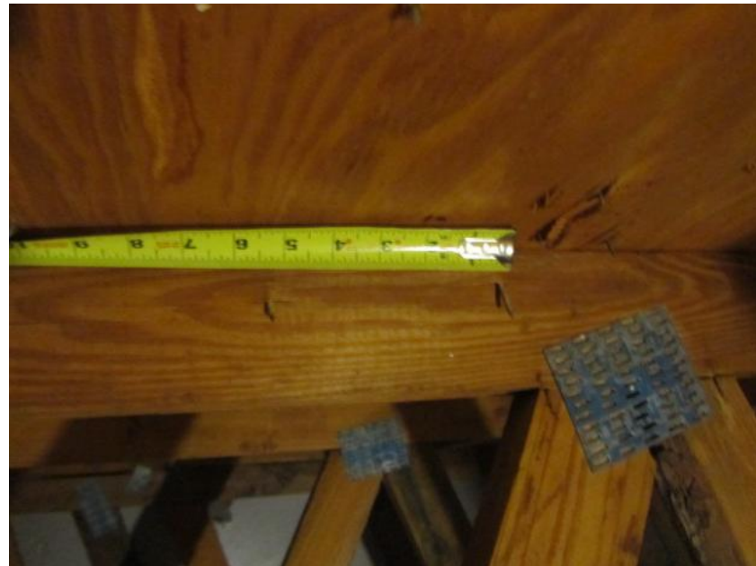
8d Nails Spaced 6" x 6"